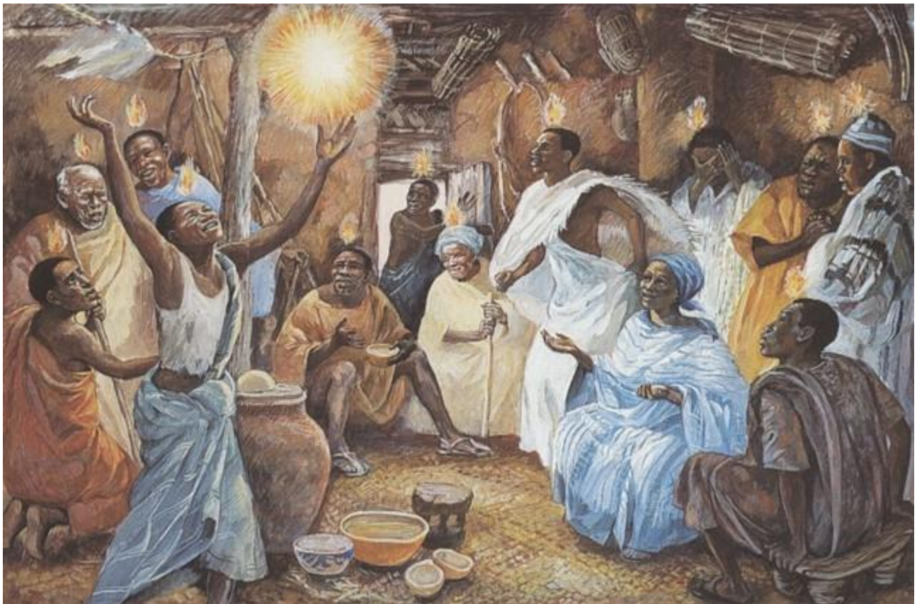
JESUS MAFA. Pentecost in Acts 2; Cameroon, from Art in the Christian Tradition , a project of the Vanderbilt Divinity Library, Nashville, TN.

MAY 28 PENTECOST SUNDAY 10 AM PLEASE WEAR RED!