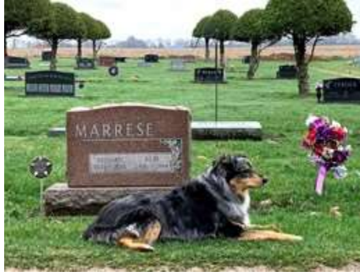
Kroghville Cemetery London, Wisconsin