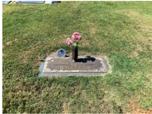
Indiana Presbyterian Church Cemetery Vincennes, Indiana

WE LOVE TO TELL THE STORY – This Sunday, July 25, we will be talking funeral arrangements, as we tell the story of the death and burial of Abraham by two of his sons, Ishmael and Isaac. Funeral planning is something most of us put off, leaving it to our loved ones to take care of after we are dead. Should we? Join us this Sunday as we tell the story of planning a funeral, and finally learn the answer to the age-old question “Who is buried in Abraham’s Tomb?” (Hint: It is not Grant!).