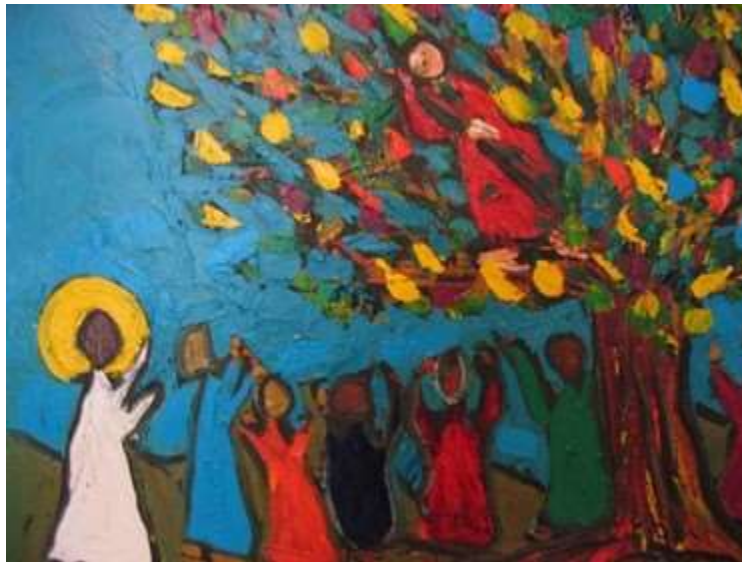
“THE BLIND MAN AND ZACCHAEUS”

THIS SUNDAY, MARCH 21, we continue our reading through the Gospel of Luke with the story of two people who are vision challenged, and wish to see Jesus. We will be reading in Luke 18:35-19:10.