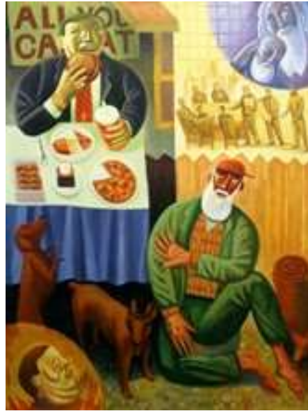
LUKE 16:19-31 “RICH MAN & LAZARUS”