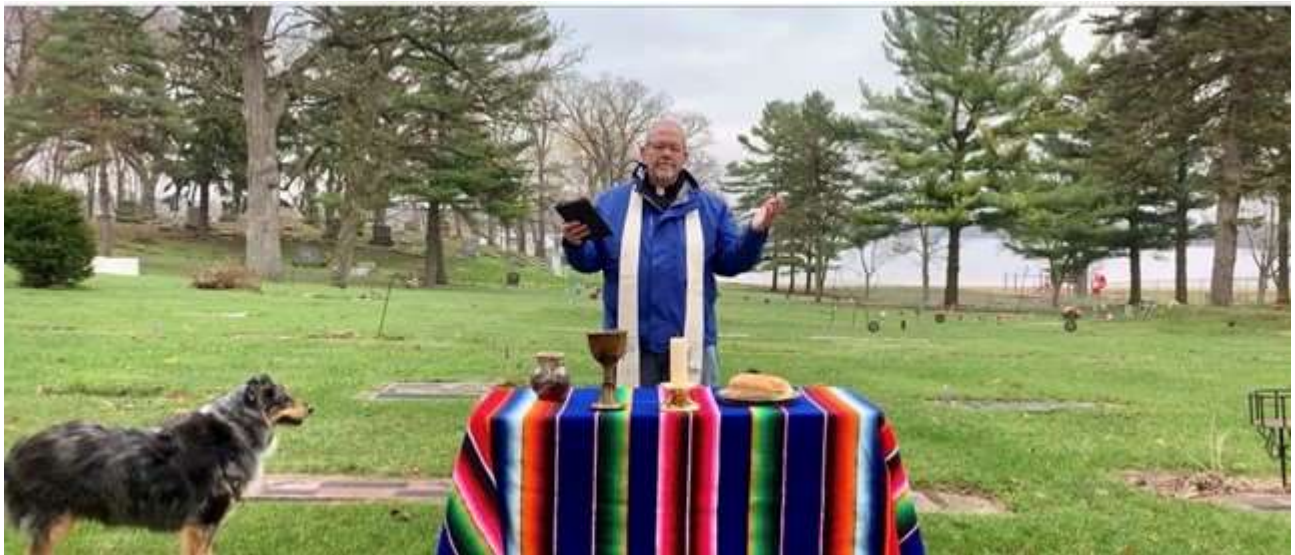
Easter Service 2019