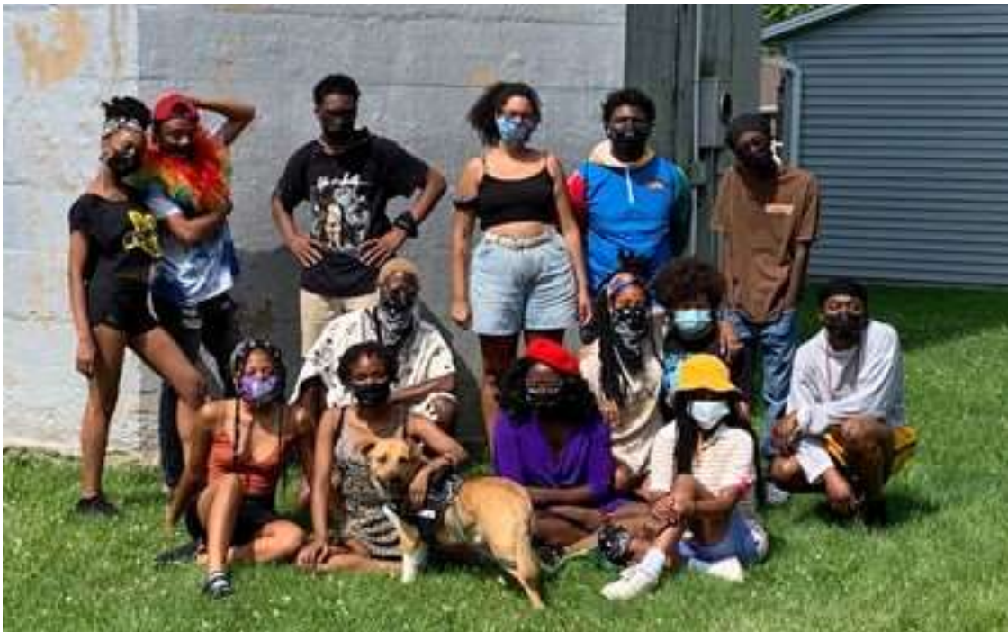
OCPCC hosted 15 youth from the “50 Miles More” on their walk from Milwaukee to Madison this past July.

WE BELIEVE we are one body. In Christ, there is to be no oppression based on race, gender, identity, or class (Galatians 3:28). The body of Christ, where those great human divisions are to be overcome, is meant to be an example for the rest of society. When we fail to overcome these oppressive obstacles, and even perpetuate them, we have failed in our vocation to the world—to proclaim and live the reconciling gospel of Christ.