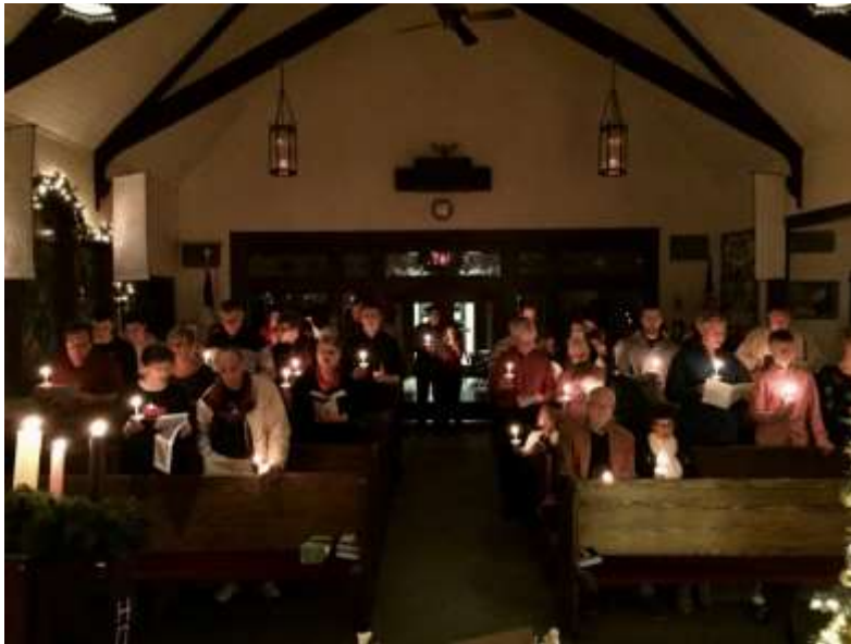
Christmas Eve Worship at OCPC